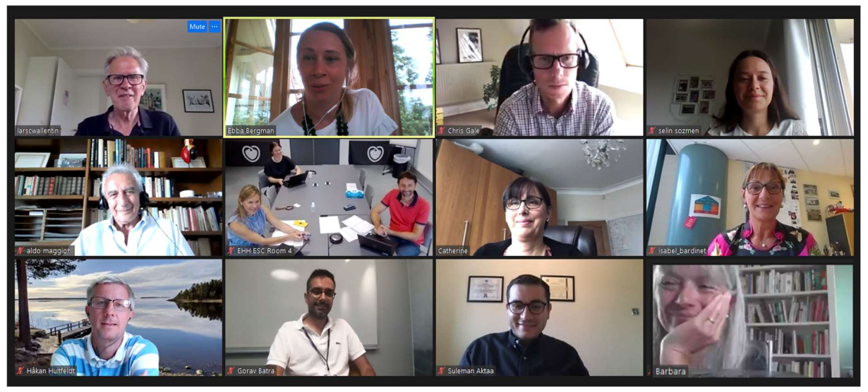
The EuroHeart team enjoying an online Executive Committee meeting

The impact of COVID-19 continues to be felt around the world. With travel limited between and sometimes within countries, our ways of working on the study have adapted with a greater reliance on IT-technology to communicate and discuss the EuroHeart study.